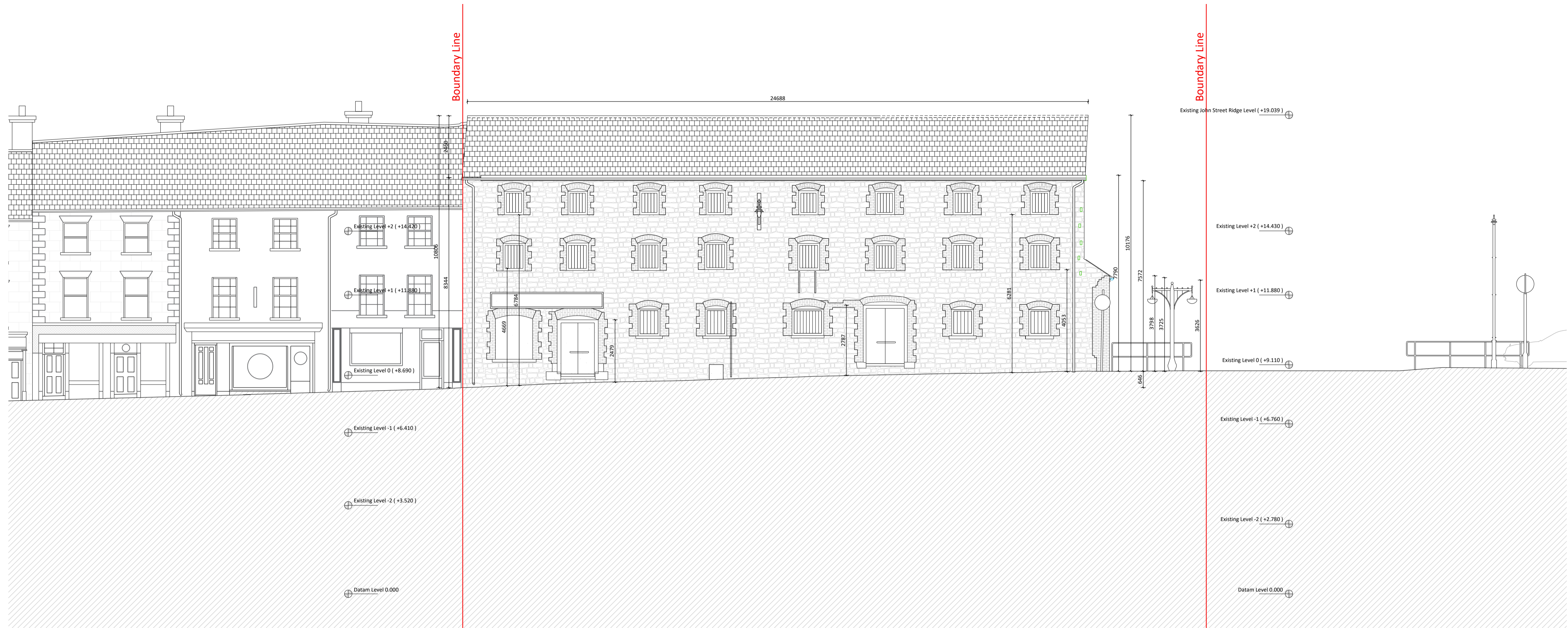
01 East (John Street) Elevation As Existing Scale: 1:100